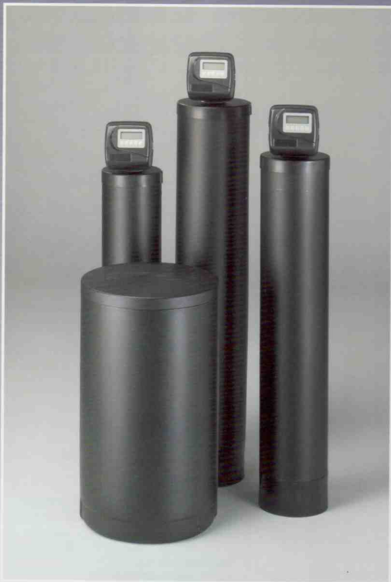
Windsor Series shown in 24,000, 32,000, and 48,000 capacities with optional tank jackets.

Experience the benefits of soft water with the efficiency of The Windsor Series